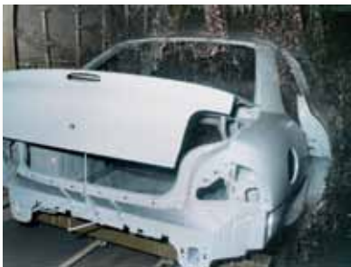
Paint & Coatings

3M Purification provides filtration and separation solutions for a wide range of industrial processes including: