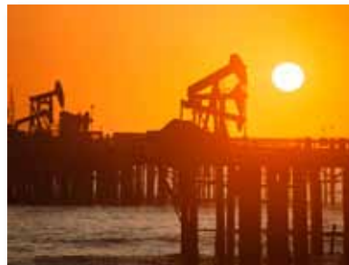
Oil & Gas Processing